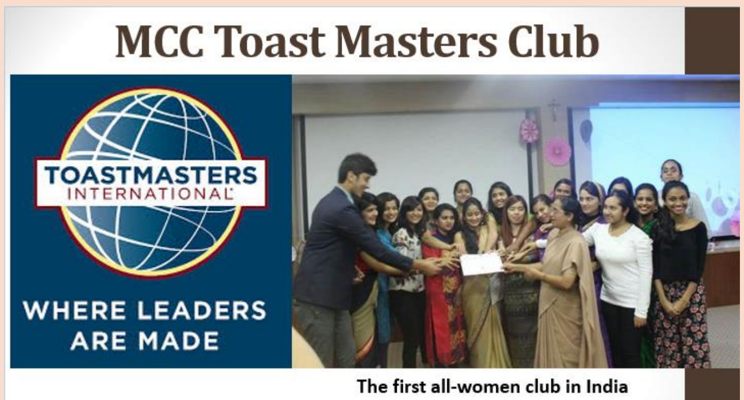
The first all-women club in India

MCC Toast Master Club was started in October 2016 by CEE. CEE Coordinates the activities of the TOAST MASTER's Club at MCC.