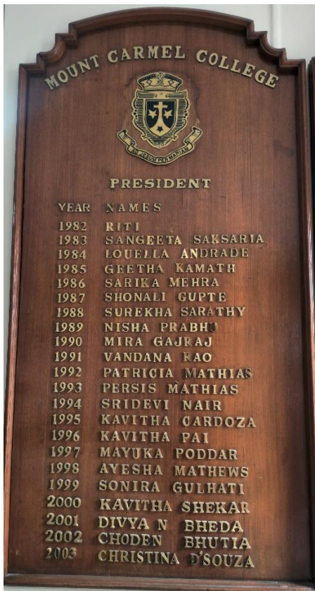
Image- Former elected Student Council presidents from 1982-2022:

The democratically elected body of the student council play an important role in ensuring student representation in all realms of campus life. The management, faculty and students aim to direct its activities along the lines of the institution missions of- ‘To facilitate leadership among students to proactively involve themselves in social liberation’ & ‘To work towards sustaining the integrity of human existence and fostering interconnectedness, kinship, and eco-justice’.